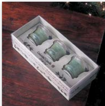
Blyth HomeScents International Gift Set Packaging QuarkXpress/Illustrator