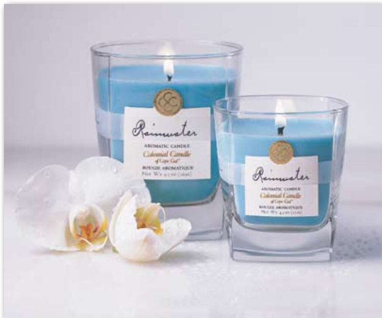
Blyth HomeScents International Product Label/Packaging QuarkXpress