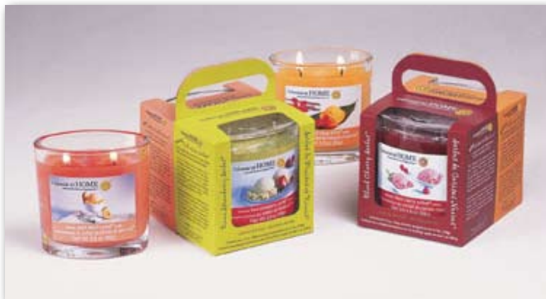
Blyth HomeScents International Product Label/Packaging QuarkXpress/Photoshop/Illustrator