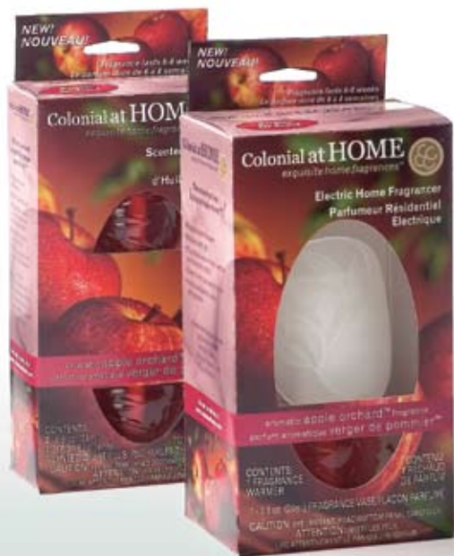
Blyth HomeScents International Packaging Illustrator