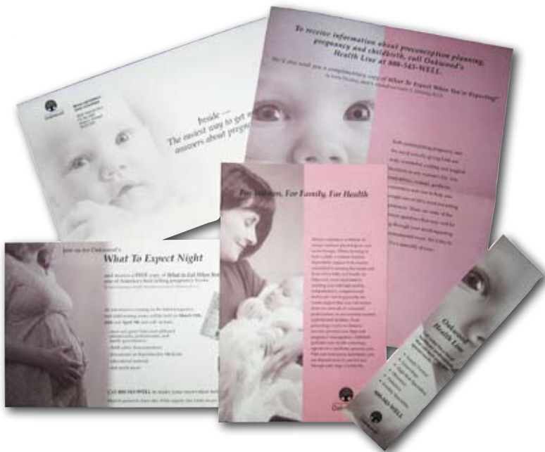
Oakwood Hospital Direct Mail Campaign QuarkXpress/Photoshop