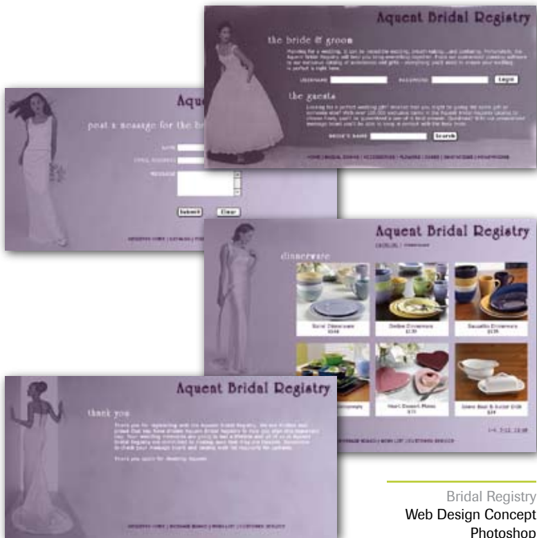
Bridal Registry Web Design Concept Photoshop